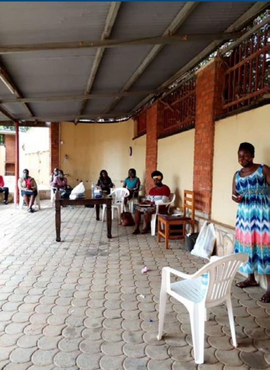
HIGH ADVENTURE AND ONE TRIBE INTERNATIONAL PARTNER TO PROVIDE KAMPALA CHURCH LEADERS WITH SKILLS TRAINING AND SMALL BUSINESS SUPPORT