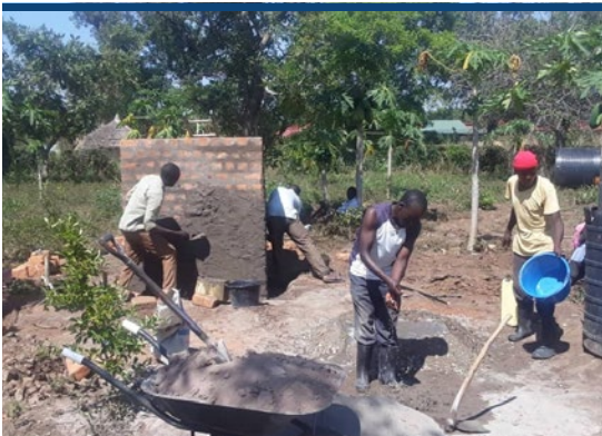
NEW WATER STORAGE SYSEM INSTALLED FOR ONGUTOI HEALTH CENTRE STAFF

PLEASE COMPLETE THE PORTION BELOW AND RETURN IN THE ENVELOPE PROVIDED. THANK YOU.