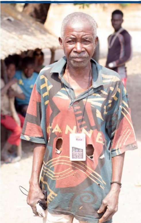
ONE LOVE FM LISTENER WITH NEW IMPAX AT MONGU HOSPITAL