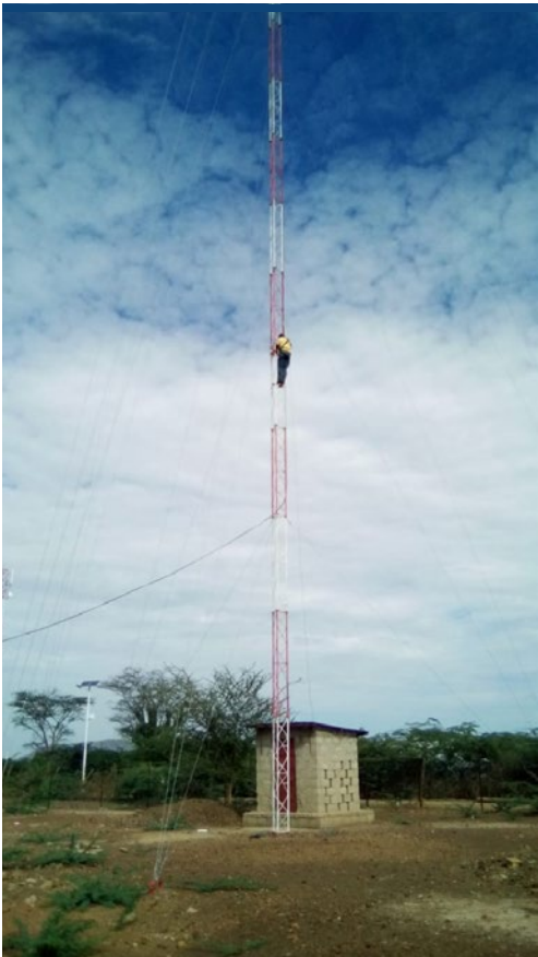
NEW SOLAR SYSTEM INSTALLED AND TOWER ADJUSTMENTS MADE AT KAKUMA FM (LOST BOYS OF SUDAN) REFUGEE CAMP IN KENYA