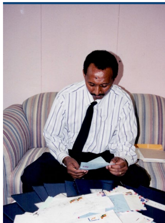
ETHIOPIAN SHORTWAVE LISTENER LETTERS ARRIVE IN ADDIS ABABA

HIGH ADVENTURE GOSPEL COMMUNICATION MINISTRIES WEBSITE: WWW.HAGCM.ORG OR WWW.BVBROADCASTING.ORG PHONE: 800-550-4670 | FAX: (905) 898-2500