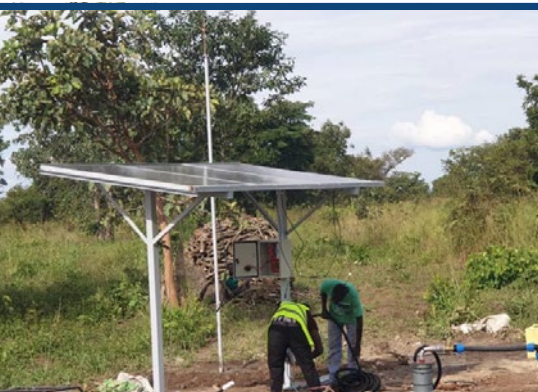
SOLAR POWERED BORE HOLE INSTALLED AT ONGUTOI HEALTH CENTRE