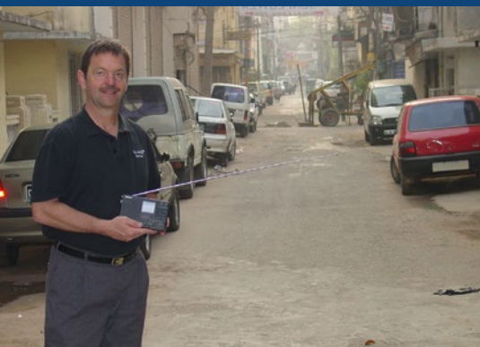
CHECKING OUR SHORTWAVE BROADCAST IN DELHI 2001