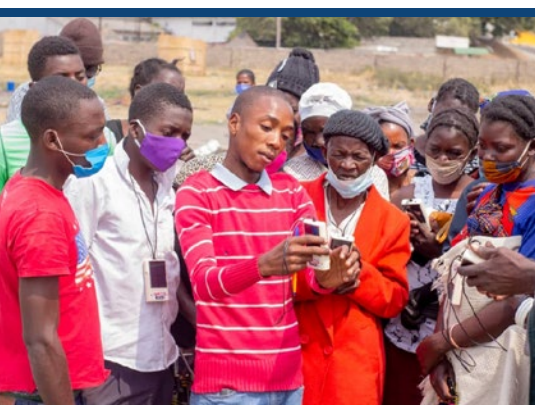
MONGU VOLUNTEER TRANSLATES IMPAX INSTRUCTIONS FOR LOZI- SPEAKING RECIPIENTS