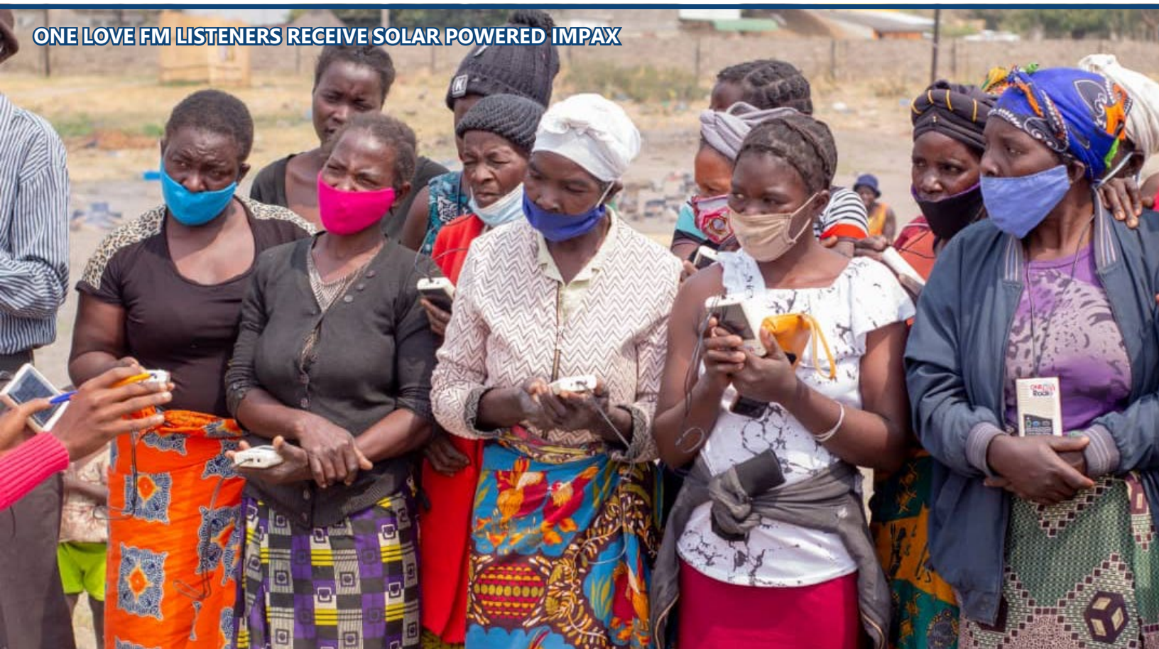
ONE LOVE FM LISTENERS RECEIVE SOLAR POWERED IMPAX

Scanning through this month's OLFM report, I was reminded afresh of the strategic value radio has in our COVID world where global communities and its