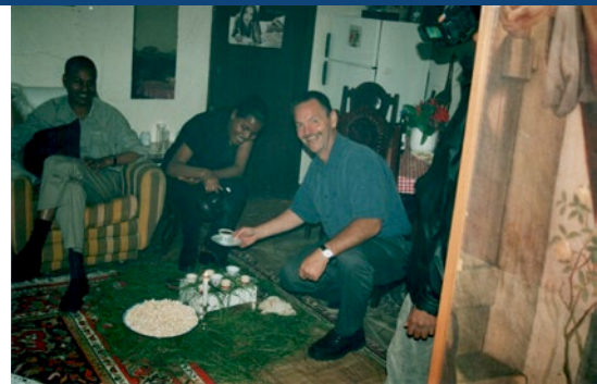
ENJOYING ETHIOPIAN HOSPITALITY-COFFEE AND POPCORN

But Mekuria's heart burns for those who cannot hear. Ethiopia today is 112 million people, and nearly 80% living in rural communities where TV cannot reach. Even if it could, most are too poor to own a TV and definitely not internet. The only way to reach 90 million unreached Ethiopians now, is what it was relevant in 2001; shortwave radio.