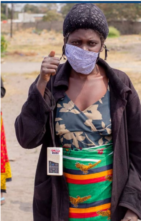
SOLAR POWERED LISTENING IN MONGU, ZAMBIA