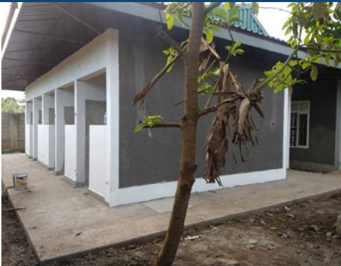
LIFE ESSENTIALS CENTRE TOILET FACILITY IN MUKONO, NEARING COMPLETION