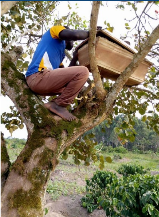
NEW BEE HIVES FOR BUTAMBALA COFFEE PROJECT