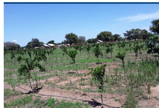
FIRST ORANGE TREES AT ONGUTOI

HIGH ADVENTURE GOSPEL COMMUNICATION MINISTRIES WEBSITE: WWW.HAGCM.ORG OR WWW.BVBROADCASTING.ORG PHONE: 800-550-4670 | FAX: (905) 898-2500