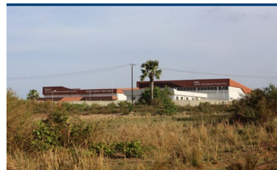
FRUIT FACTORY READY FOR ORANGES