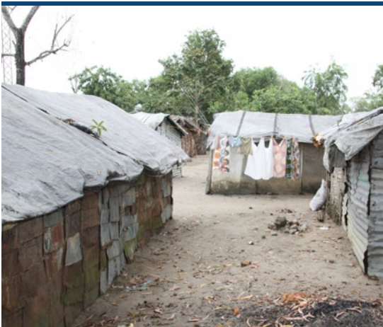
BOMI REFUGEE CAMP NEAR WORSHIP FM