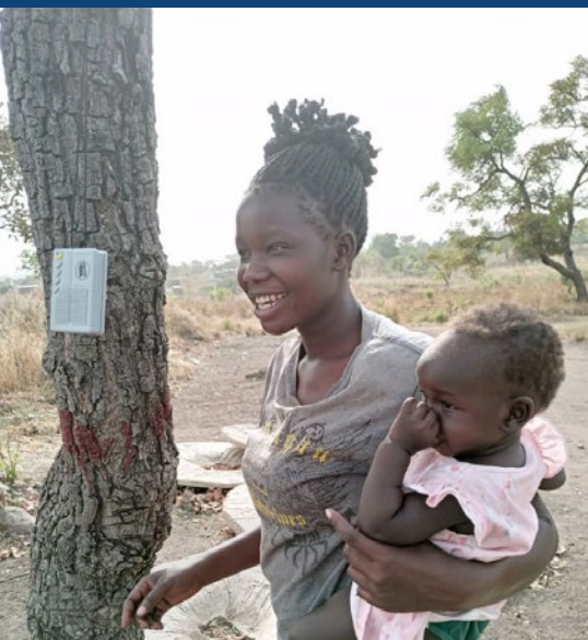
HAPPY REFUGEE MOTHER RECEIVES HER SOLAR RADIO