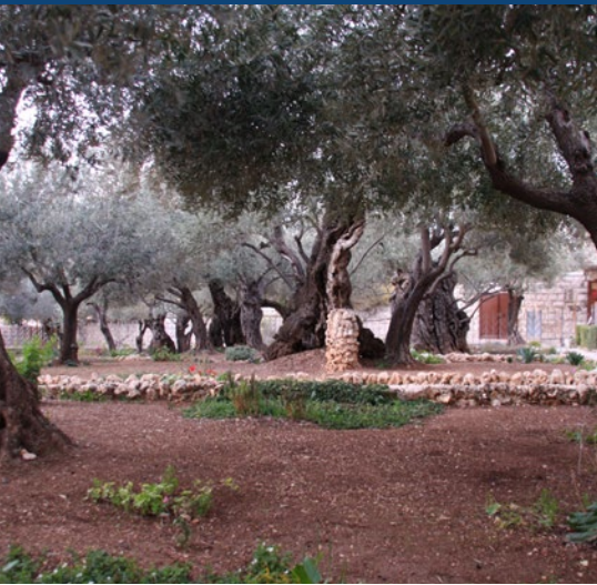
MOUNT OF OLIVES TODAY