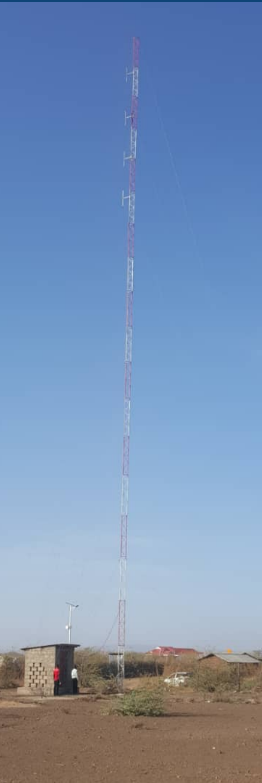
KAKUMA FM REFUGEE RADIO IN REMOTE LOCATION