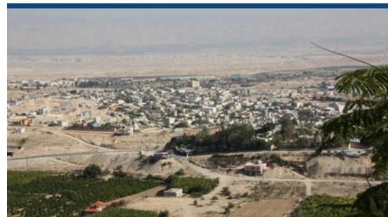
JERICHO OVERLOOKING JORDAN (ANCIENT MOAB)