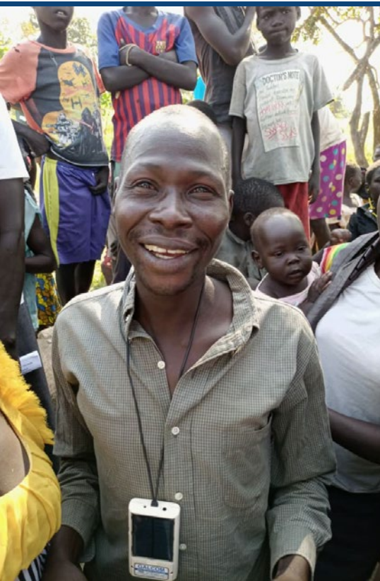
HOUSEHOLD RECEIVES RADIO CONNECTION TO USALAMA FM