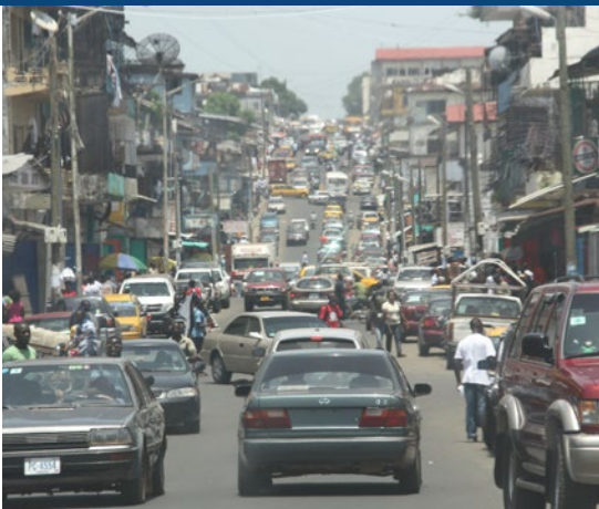
DOWNTOWN MONROVIA, LIBERIA