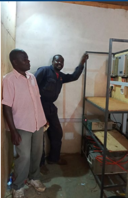
KAKUMA FM NEEDS BATTERIES FOR NIGHT BROADCAST