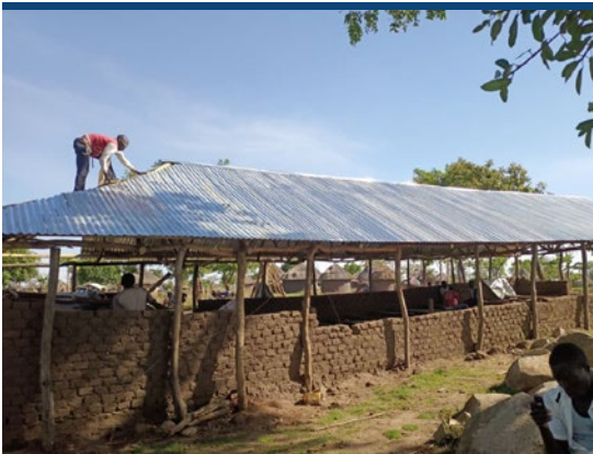
MAJII BAPTIST CHURCH WILL SOON CELEBRATE IN WORSHIP