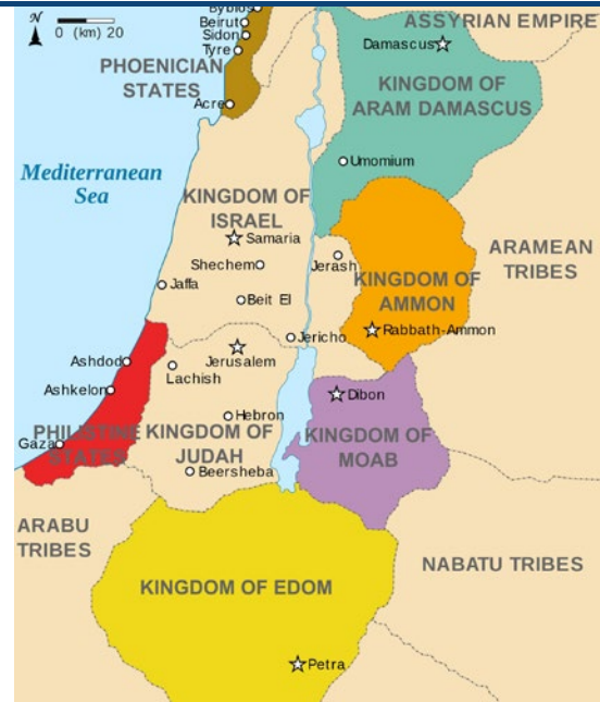
ANCIENT ISRAEL

This good news of the kingdom will be proclaimed in all the world, as a testimony to all nations. And then the end will come. Matt 24:14 HCSB