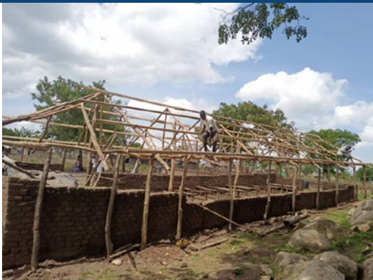
NEW CHURCH FOR 200 REFUGEES DONATED