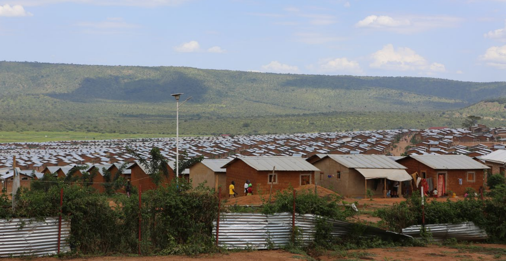
RWANDA'S MAHAMA REFUGEE CAMP HEARING RESTORE FM