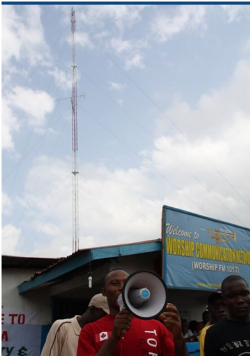
WORSHIP FM NEEDS TOWER AND ANTENNA UPGRADE TO REACH FARTHER