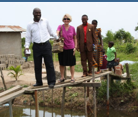
GOING TO CHURCH IN LIBERIA (A FEW YEARS AGO)

PLEASE COMPLETE THE PORTION BELOW AND RETURN IN THE ENVELOPE PROVIDED. THANK YOU.